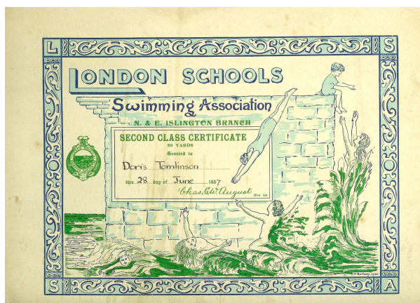
Some of Judy's Swimming Certificates