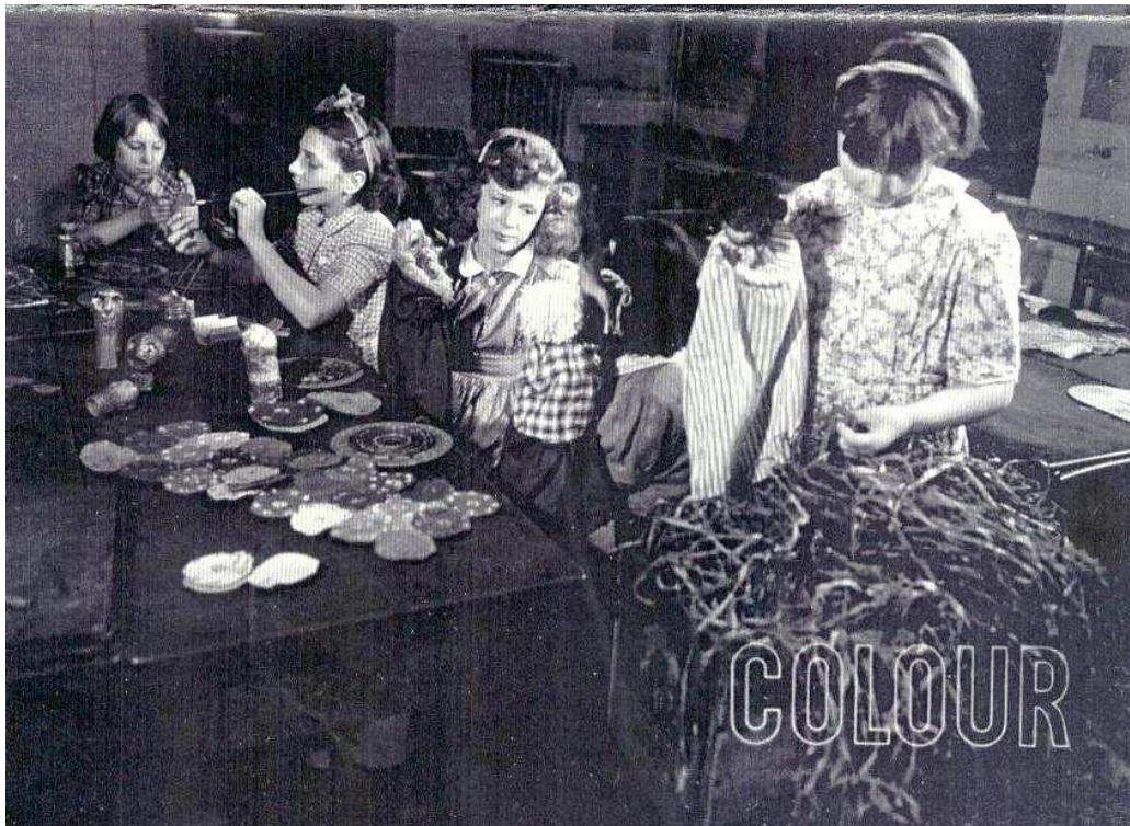
“10 and 11 year old girls make puppets and do raffia work” 1944