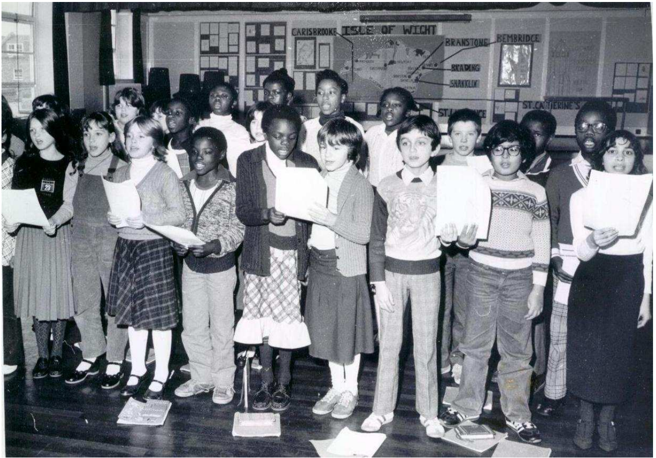
School Choir in 1977 preparing for a concert in the Royal Festival Hall