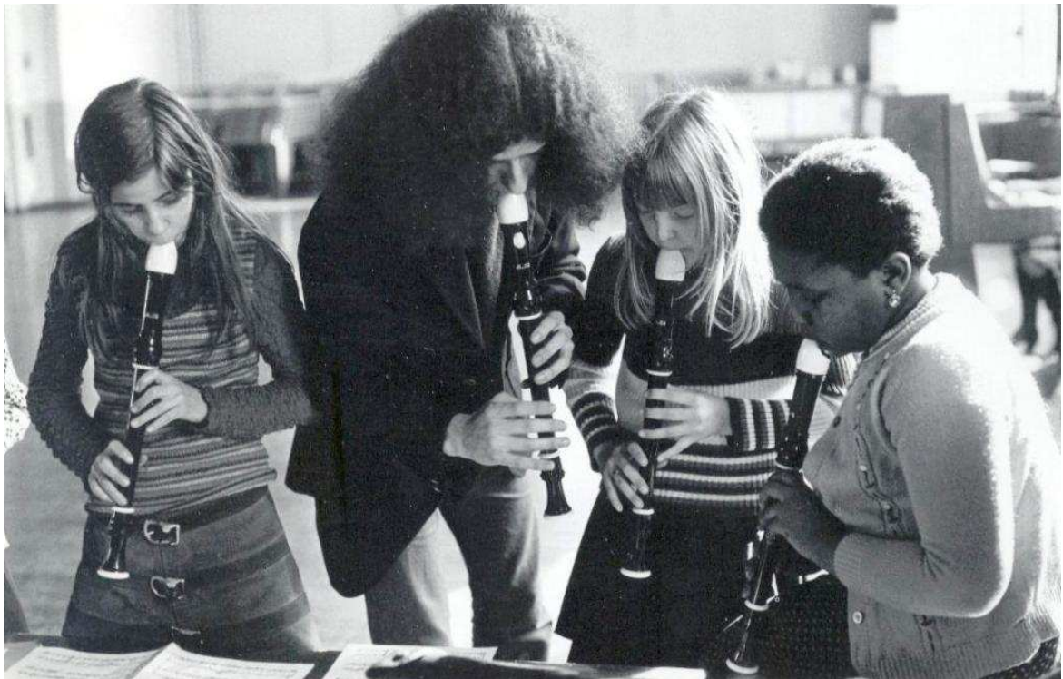
1970's Recorder lesson