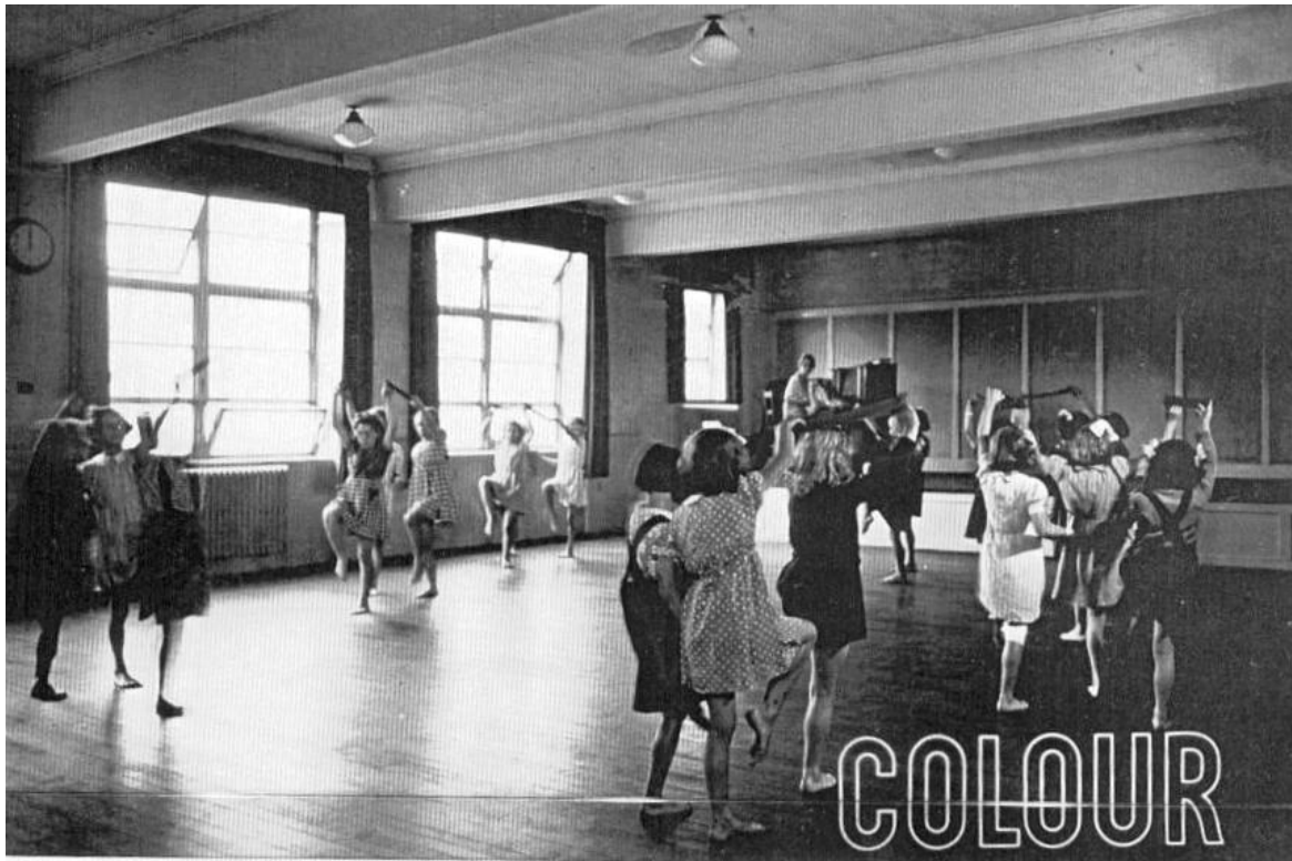
The caption for these 1944 photographs, now held by the National Archive is as follows: "Barefooted, a class of 10 and 11-year old girls practise folk dancing - a Norwegian 'Mountain March' in the school's fine hall." British Official Photograph. Monochrome print from colour negative.